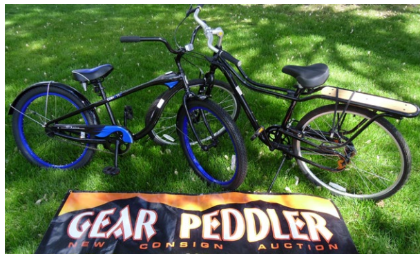
Grand Prize: Schwinn bicycles from Gear Peddler.

Registration forms are available for pick up at the Deschutes Historical Museum (129 NW Idaho Ave, Bend) and Gear Peddler (184 NE Greenwood Ave, Bend) or download from our website www.deschuteshistory.org . You will also find a copy of the registration form on page 3 in the Homesteader.