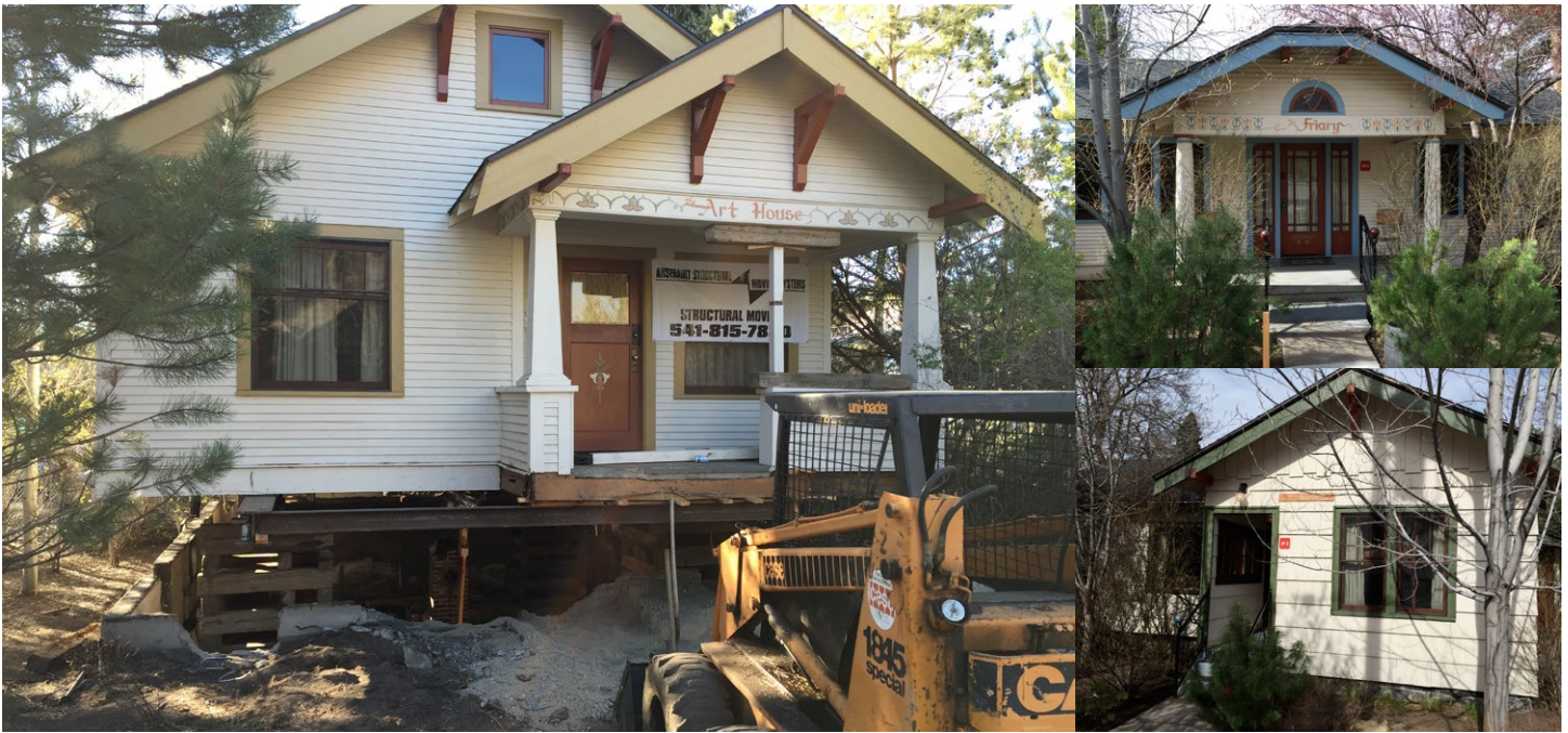
The Lava Road and Louisiana bungalows are already in place in Sunriver. These pictures were taken shortly before the move. The large picture shows 535 NW Lava Road (The Art House) on stilts before the move. The two smaller pictures from top: The Friary (525 NW Lava Road) and 16 NW Louisiana Ave. (The Nunnery).