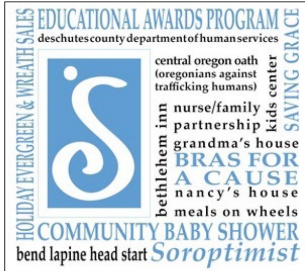
The Soroptimists International Club of Bend has a long history in the community.