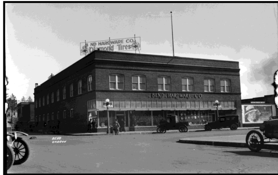
Bend Hardware, built 1918

Tell us where these buildings were located, or what is in its place today.