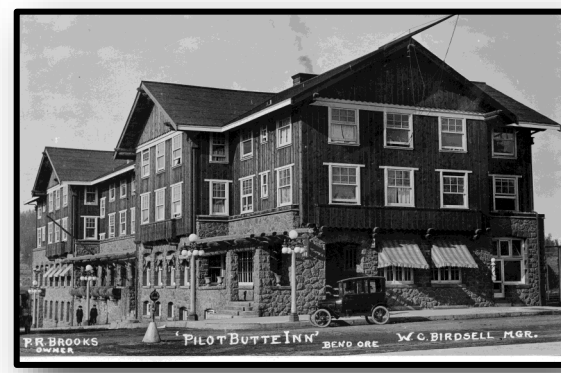
Pilot Butte Inn, built 1917

Each correct answer is worth ten (10) points. For bonus points circle its location on your map.