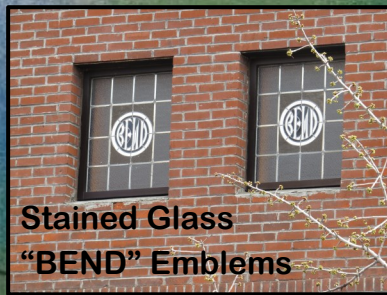
Stained Glass "BEND" Emblems