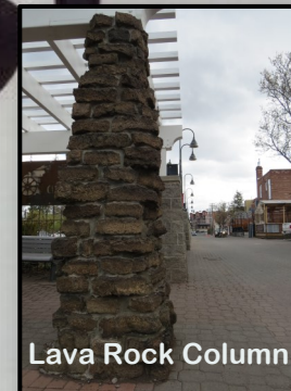
Lava Rock Column