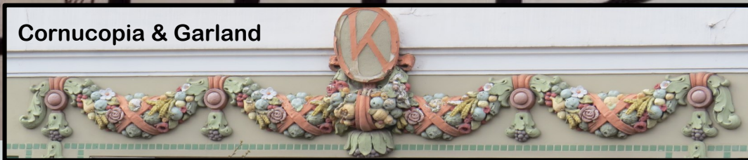
Cornucopia & Garland