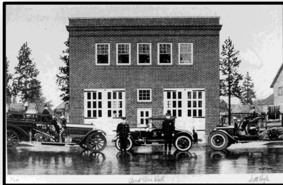
Fire Station, built 1920