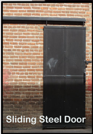
Sliding Steel Door