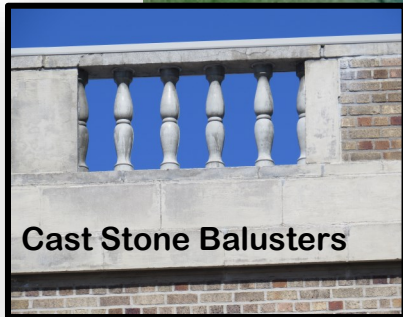
Cast Stone Balusters