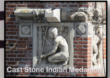
Cast Stone Indian Medallion