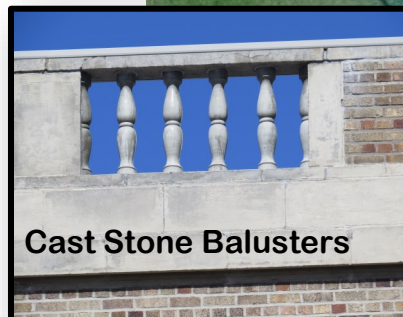
Cast Stone Balusters