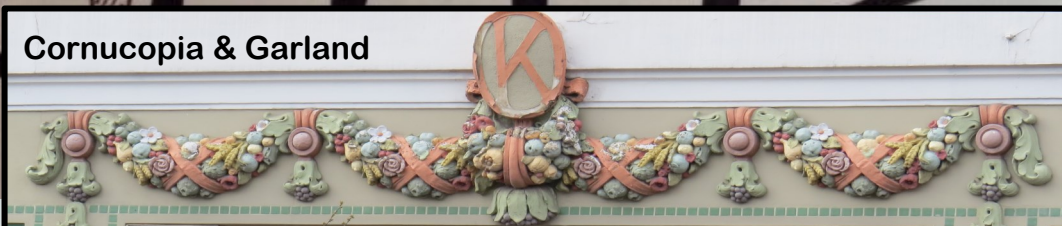
Cornucopia & Garland