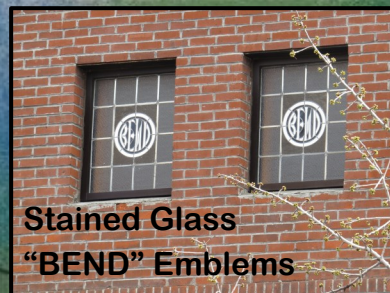
Stained Glass "BEND" Emblems