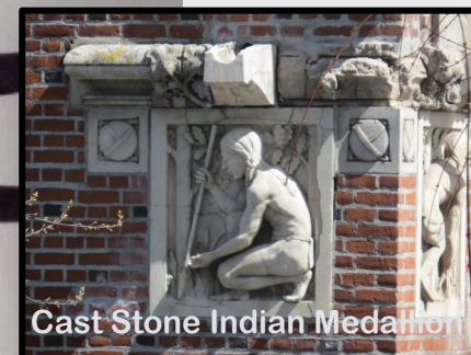
Cast Stone Indian Medallion