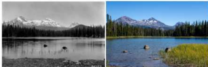
View of Three Sisters Lake from Scott Lake shoreline. Left: September 16, 1920. Right: September 8, 2022.

This exhibit is expected to be open in February, look for more information in the February Homesteader .