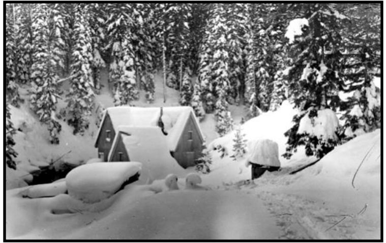
Bridge Creek Water Intake, ca 1945

Bend's water system didn't become a cornerstone of the City of Bend by accident. It became one through a deliberate shift from private ownership to public stewardship 100 years ago. Over the decades since, the community built a dual source network designed for reliability, resilience and the shared responsibility of managing a vital resource.