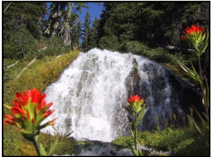
Prowell Springs, deep in the Deschutes National Forest, flows into Bridge Creek above the City of Bend’s water intake.

Next for Bend is a series of proposed changes that aim to address capacity limits and projected growth over the coming decades. The proposed expansion of the Outback Water Filtration Facility would add a pretreatment system to address sediment, new reservoirs and groundwater wells, enhanced site security to meet federal requirements, and in-conduit hydropower equipment to offset energy use. Plans also include a wildfire water fill station intended to support emergency response. City officials say the proposed improvements are intended to support drinking water reliability, system maintenance, and emergency preparedness over the next 20 years and beyond.