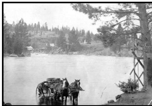
Lace Reed dipping water from the Deschutes River (later the location of Pioneer Park), adding to the barrel on his water wagon.